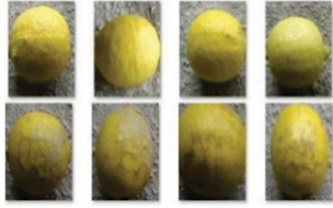
Fig. 1. Good and bad quality lemons