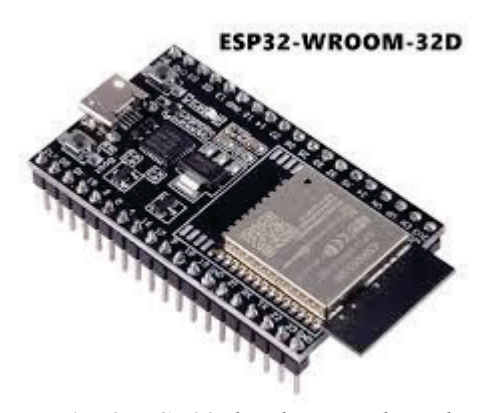
Fig. 2. ESP32 development board

both single-core and dual-core variations of Tensilica's 32-bit Xtensa LX6 the microprocessor with integrated 2.4GHz Wi-Fi and dual-mode bluetooth connectivity. The microprocessor operates at 160 or 240MHz of the clock and performs up to 600 DMIPS. ESP32 integrates an antenna switch, RF balun, power amplifier, low-noise receive amplifier, filters, and power management modules. As such, the entire solution occupies minimal printed circuit board (PCB) area. Typical ESP32 development board, Fig. 2, is based on ESP-WROOM-32 module available in the market.