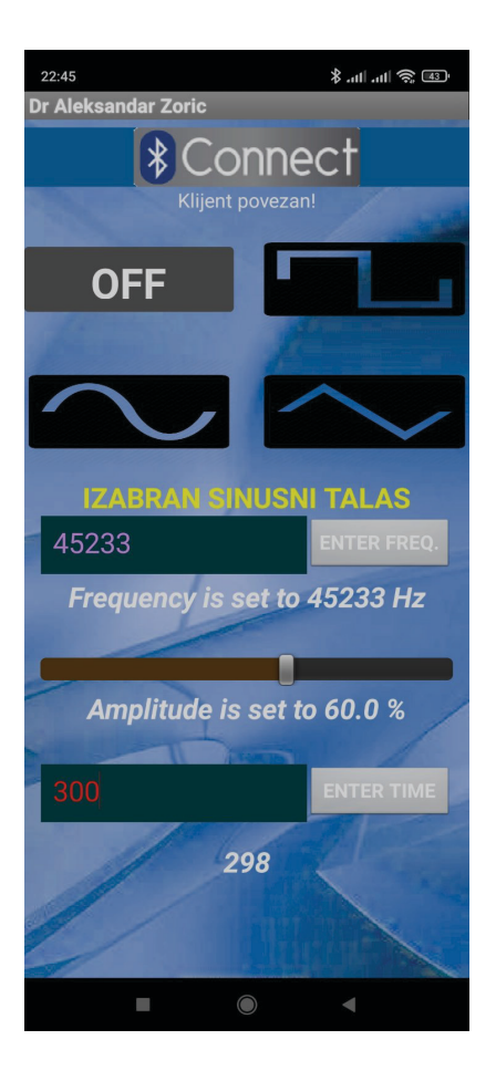
Fig. 4. The function generator application interface on a mobile phone

The amplitude of the selected waveform can be changed by changing the position of the slider. The amplitude is set in percent of full scale. There is a label with selected amplitude in percent below the slider, also.